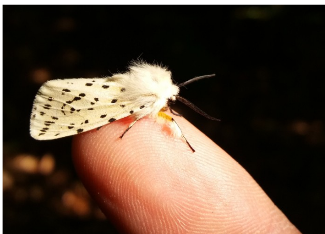
White Ermine [ Spilosoma lubricipeda ]

Many people are intimidated by the challenge of counting wildlife or worried about incorrect identification. Personally, I love the challenge and the opportunity to see as much wildlife as possible. Currently my passion is moths.