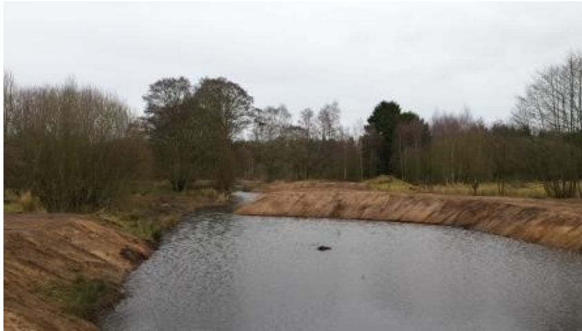
A day later with the water levels back to normal