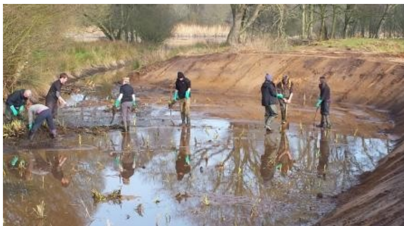
Volunteers & colleagues planting reeds

We took advantage of the water levels which had been deliberately lowered to allow excavation work to go ahead, and a group of colleagues and volunteers helped us plant up reeds in the prepared beds.