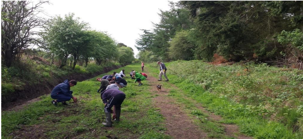
Bell Baxter High School pupils planting wildflowers along the south loch footpath