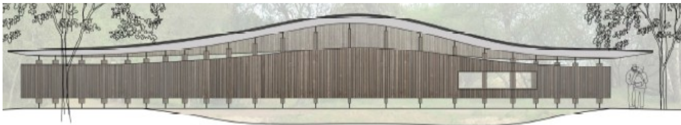
Education Pavilion the South Elevation. Drawing by Kirsty Macguire.