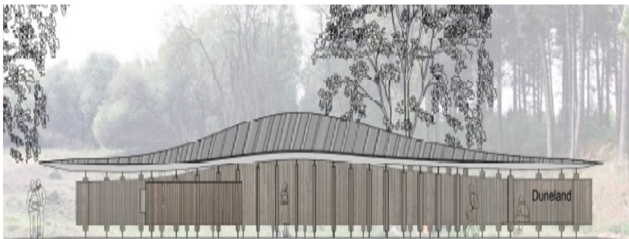
The North View of the Education Pavilion, architectural drawing by Kirsty Macguire.

The planning and preparation work for the annual Family Day event are all going on apace. Read on inside.