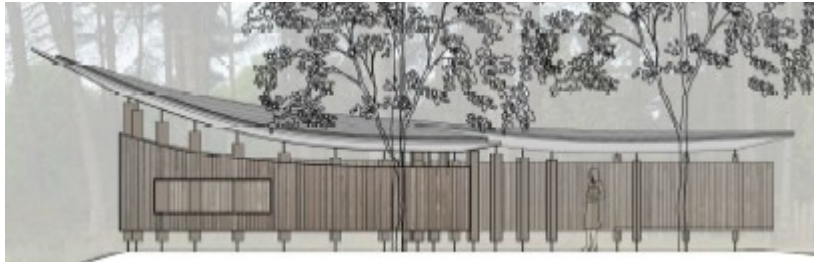
Education Pavilion the East Elevation. Drawing by Kirsty Macguire

The Education Shelter or the Pavilion as Kirsty describes the structure will be sited on a piece of land just inside the Icehouse entrance to Tentsmuir Point . It will sit within the birch alder woodland on land previously disturbed by the clearance of the boundary ditch. It will sit within the wooded landscape but provide open views out towards the duneland - a perfect entrance to the Reserve, at home in its environment.